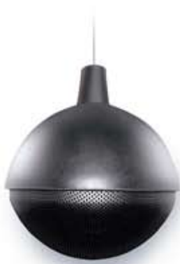
Optional Safety Cable