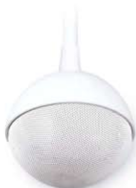
PVC Mounting Hardware