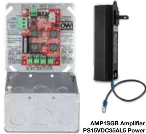
AMP1SGB Amplifier with PS15VDC35AL5 Power Supply

SINGLE INPUT WALL AMPLIFIER IN A "UL RATED" GANGBOX