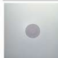
2X2IC6NA - 8 Ohms, 6.5", 2-Way