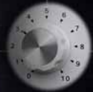
LINE LEVEL VOLUME CONTROL