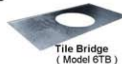
Tile Bridge (Model 6TB)